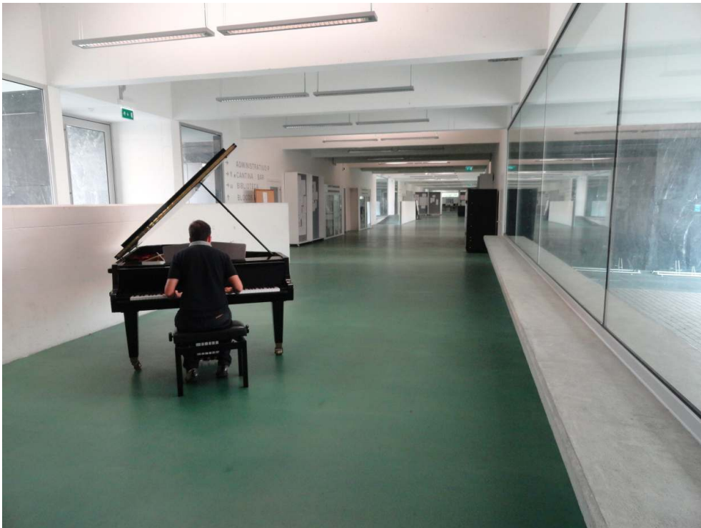
Illustration 6: Quinta das Flores School in Coimbra, Portugal. The common hall