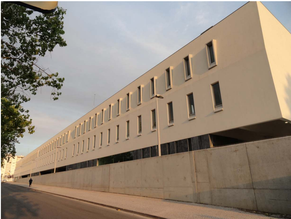
Illustration 3: Quinta das Flores School in Coimbra, Portugal. The new façade provided by the rehabilitation in 2009