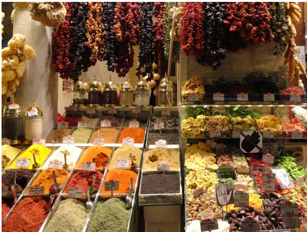
Illustration 1: Spice Market in Istanbul

An environment with intense and vibrant colours and scents.