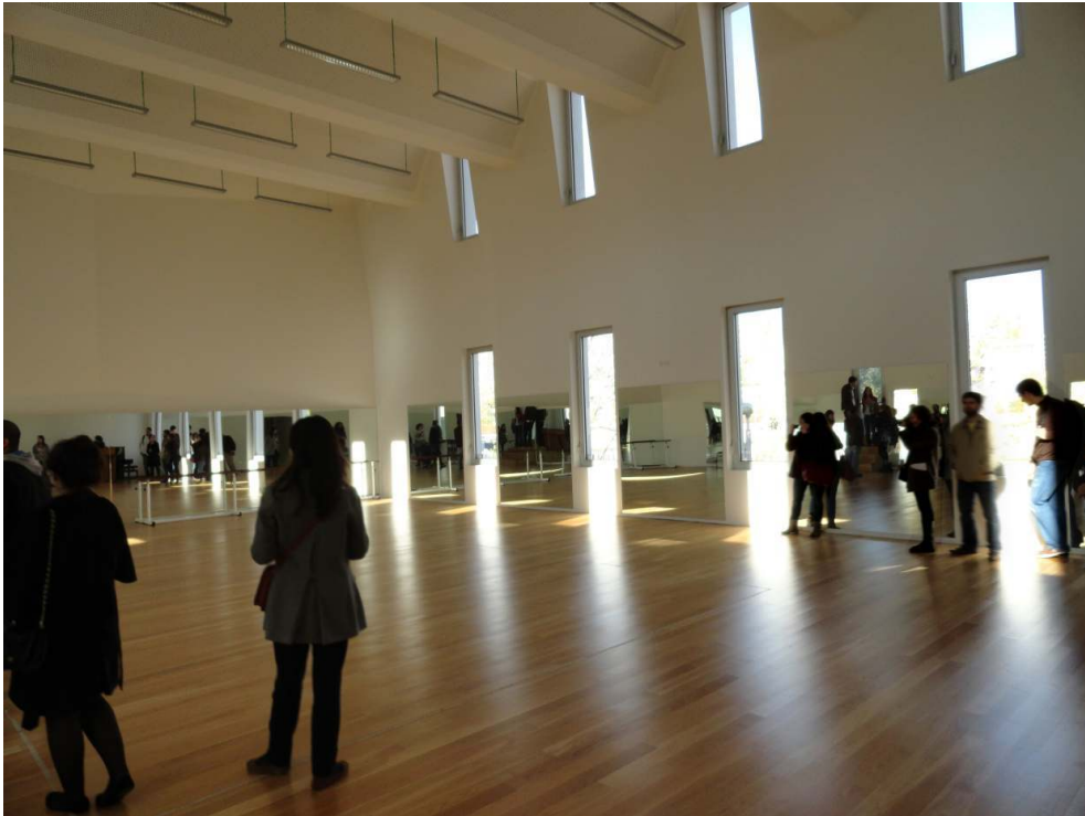
Illustration 5: Quinta das Flores School in Coimbra, Portugal. A formal dance studio