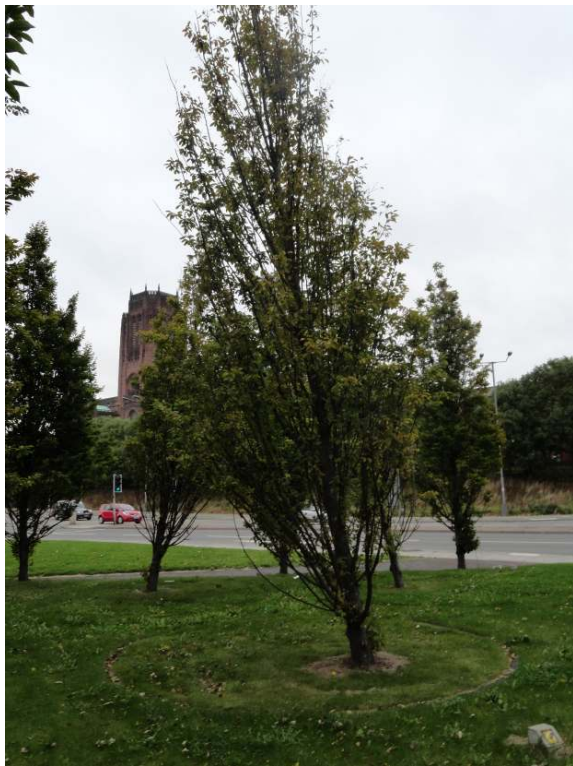
ONE OF THE TREES ROTATING ON A TURNTABLE.