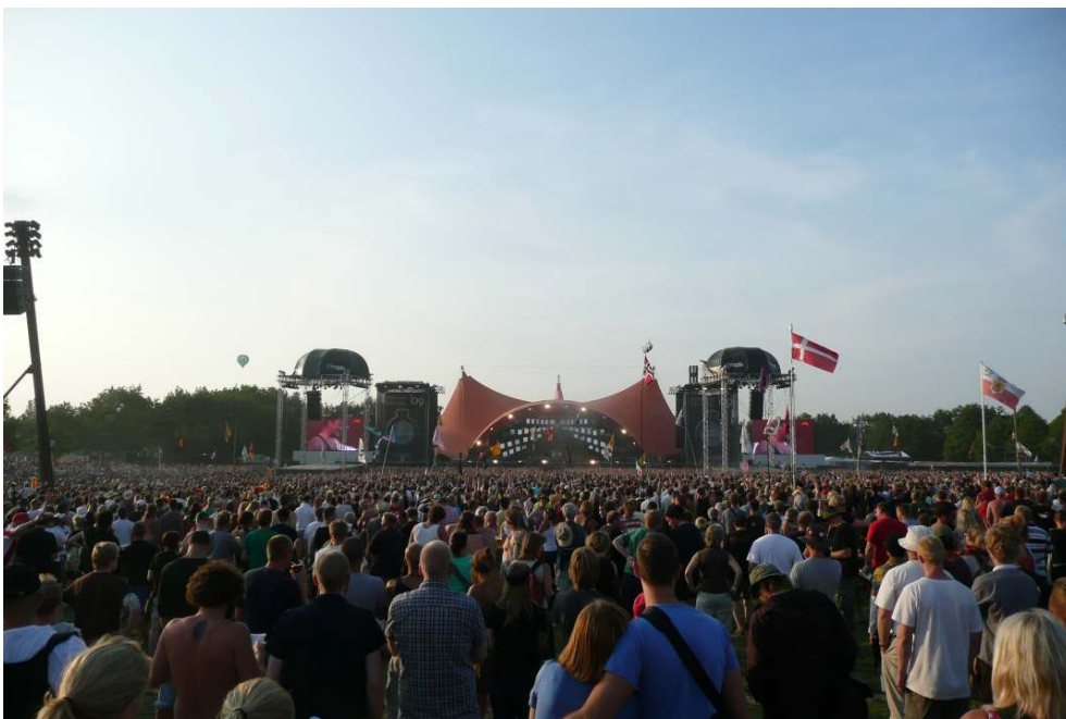
Illustration 3: Orange stage

THE ICON OF THE ROSKILDE FESTIVAL IS THE ORANGE STAGE BOUGHT FROM ROLLING STONES. IT SERVES AS A LANDMARK AND AS A NODE IN THE CITY CENTRE – IT HAS BECOME AN ICON AND HAS EVEN BEEN PICTURED ON ONE OF DENMARK'S OFFICIAL POSTAGE STAMPS