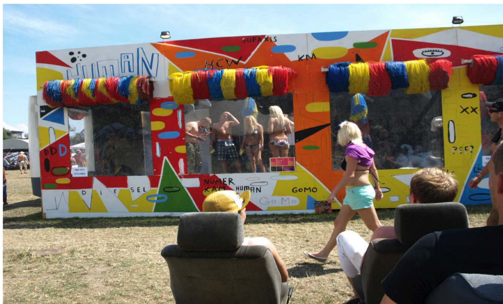
Illustration 13b. "The Human Car Wash – Installation"

"The Human Car Wash – Installation" buries the capitalistic world's materialism (the car) – and at the same time the care for humans is reborn. That is the atmosphere of lightness, laughter and freedom in combination with open-mindedness and human responsibility.