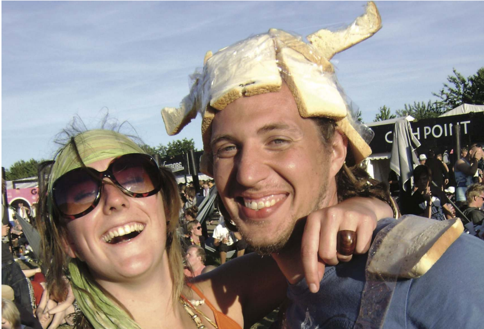
Illustration 8: Nordic Viking