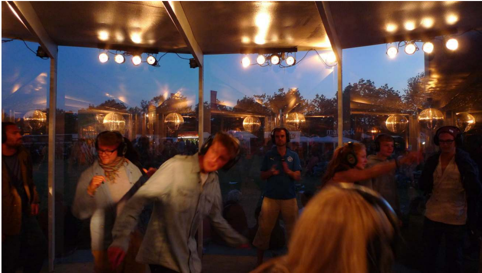
Illustration 12. AVPD: Pose/Expose, 2010, interior