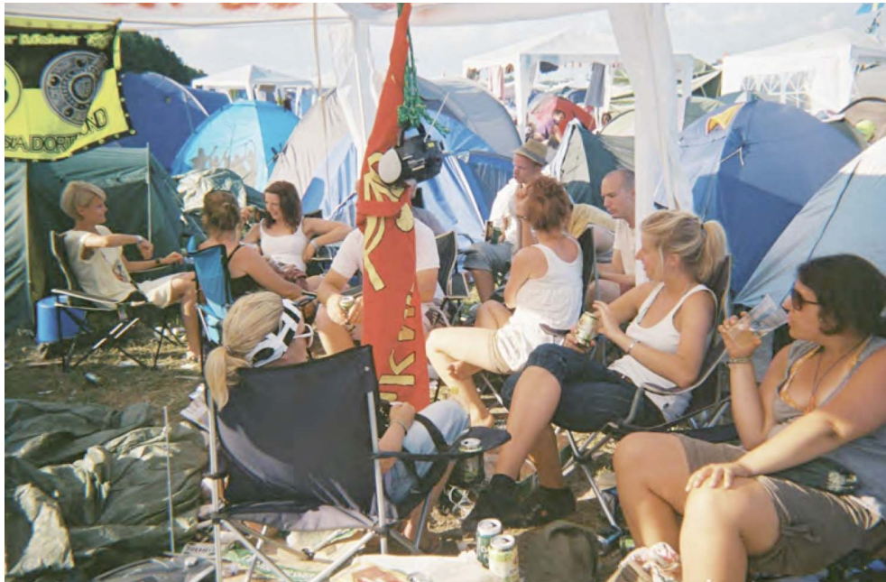
THE "GEMEINSCHAFTS" AT ROSKILDE FESTIVAL ARE OPEN AND INVITING – THE CAMPS ARE OPEN EVEN FOR STRANGERS JUST TO DROP

Source and copyright: © Marling & Kiib, first published in (Marling & Kiib, 2011), with the authorization of the authors and editors.