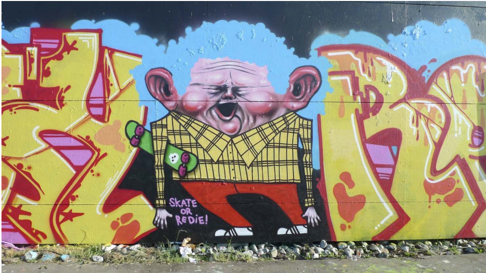
GRAFFITI ART AT THE SKATE STAGE: THE BODY IS PRESENTED WITH A LARGE HEAD AND WITH BIG MOUTH AND EARS. THIS IS AN EXAMPLE OF EXAGGERATION