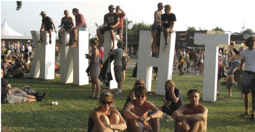
Illustration 11. Sculpture or 'think-construction' at Roskilde Festival 2009.

YOU LOOK AT IT – YOU CLIMB ON IT AND YOU REFLECT ON IT. IT WAS LOCATED JUST NEXT TO A SMALL MEMORIAL PARK FOR THE FESTIVAL-GOERS WHO DIED AT THE 2000 FESTIVAL.