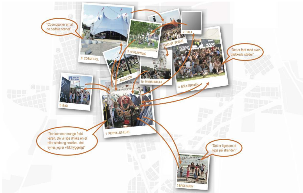
Illustration 6a: Interview with a festival participant. Songline Map

Source and copyright: © Marling & Kiib, first published in (Marling & Kiib, 2011, p. 141), with the authorization of the authors and editors.