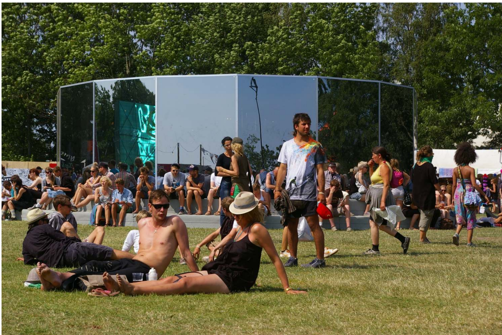
Illustration 2: Pose/Expose, 2010, exterior

SOURCE AND COPYRIGHT: ©LINE MARIE BRUUN JESPERSEN, FIRST PUBLISHED IN (MARLING AND KIIB, 2011), WITH THE AUTHORIZATION OF THE AUTHORS AND EDITORS.