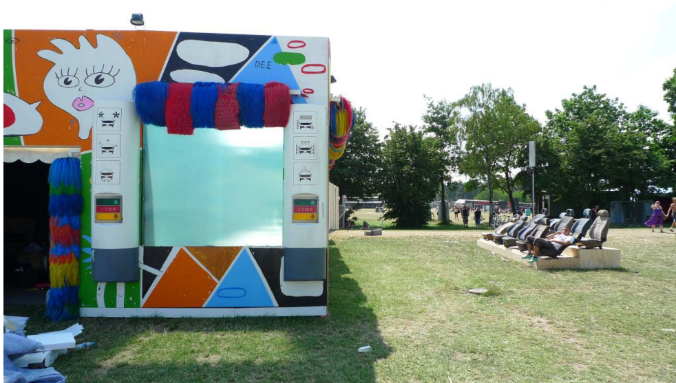
Illustration 13a: "Human Car Wash" 2009

Source and copyright: © Hans Kiib, first published in (Marling & Kiib, 2011), with the authorization of the authors and editors.