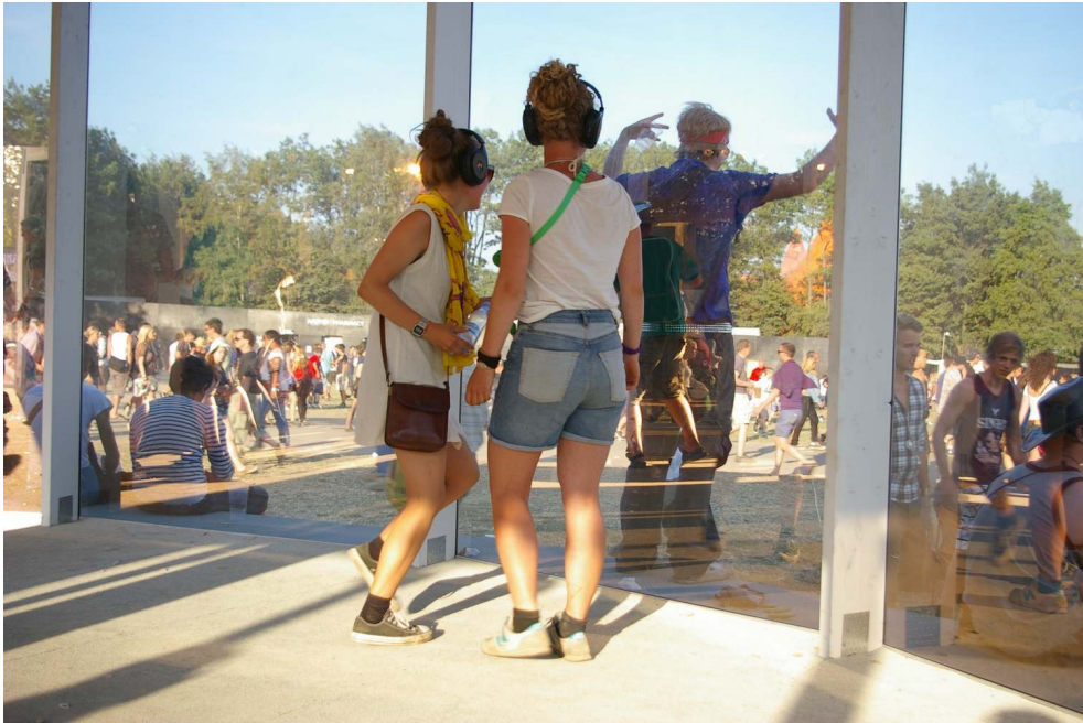
Illustration 1: Pose/Expose, 2010, exterior

DURING THE DAY THE DANCE FLOOR IN THE PAVILION WORKS AS A STAGE, FROM WHICH THE DANCERS CAN OBSERVE THE BUSY LIFE THAT GOES ON OUTSIDE. NO-ONE CAN LOOK IN AT THE DANCERS, SO AN ATMOSPHERE OF A SECRET, YET VOYEURISTIC VIEWING POSITION IS ESTABLISHED FOR THE DANCERS.